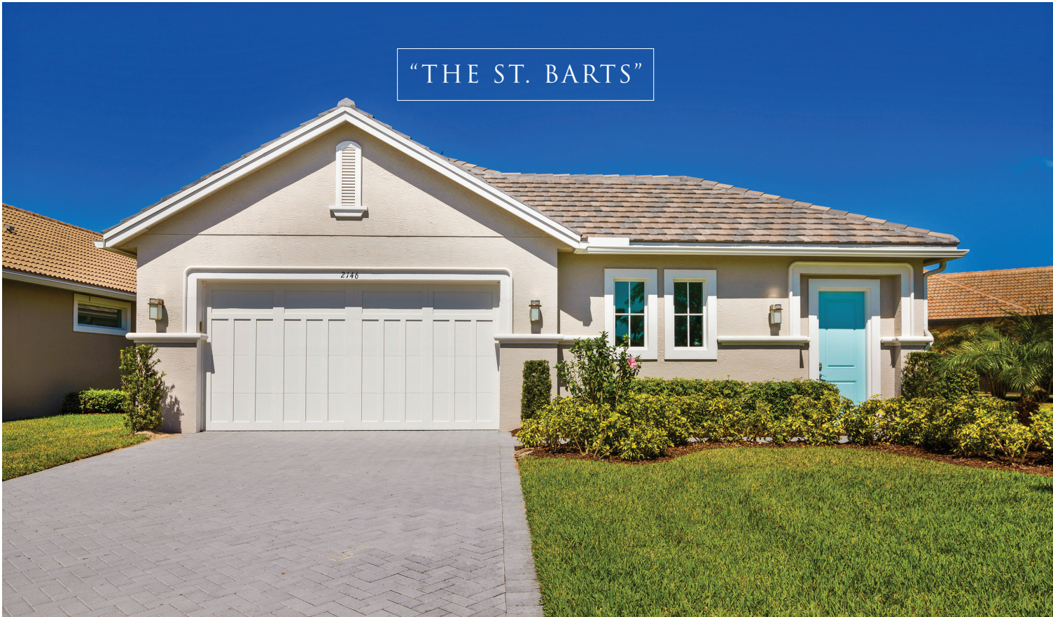
"THE ST. BARTS"